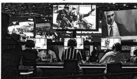
Videogaming has been marred for years by accusations of inequality and misogyny.

Activision said the lawsuit includes distorted and, in many cases, false allegations of its past, and that it strives to pay all employees fairly. "We are confident in our ability to demonstrate our practices as an equal opportunity employer that fosters a supportive, diverse and inclusive workplace for our people, and we are committed to con-